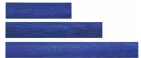
WOOD PLANKS 12"