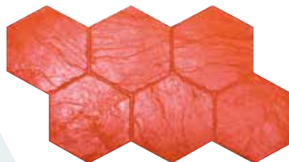
EXAGON ITALIAN SLATE