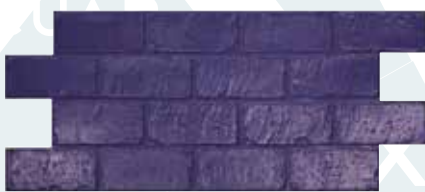
RUNNING BOND USED BRINK