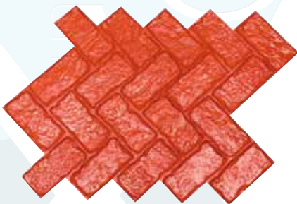
HERRINGBONE OLD COBBLE STONE