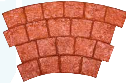
RADIUS COBBLE STONE